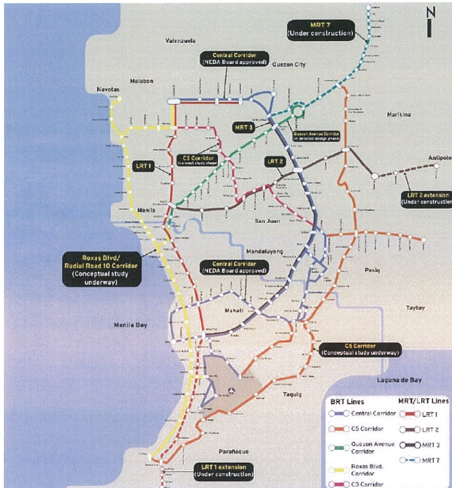
Figure 1. Mass transit network for Metro Manila.

The Government of the Philippines has embarked upon an investment program to significantly improve the quality and performance of public transport and non-motorized transport in view of the worsening traffic conditions in Metro Manila. Through the Department of Transportation (DOTr), an integrated network of mass transit and greenway corridors has been envisioned in the metropolitan area. Figure 1 shows the mass transit network being developed by the Government.