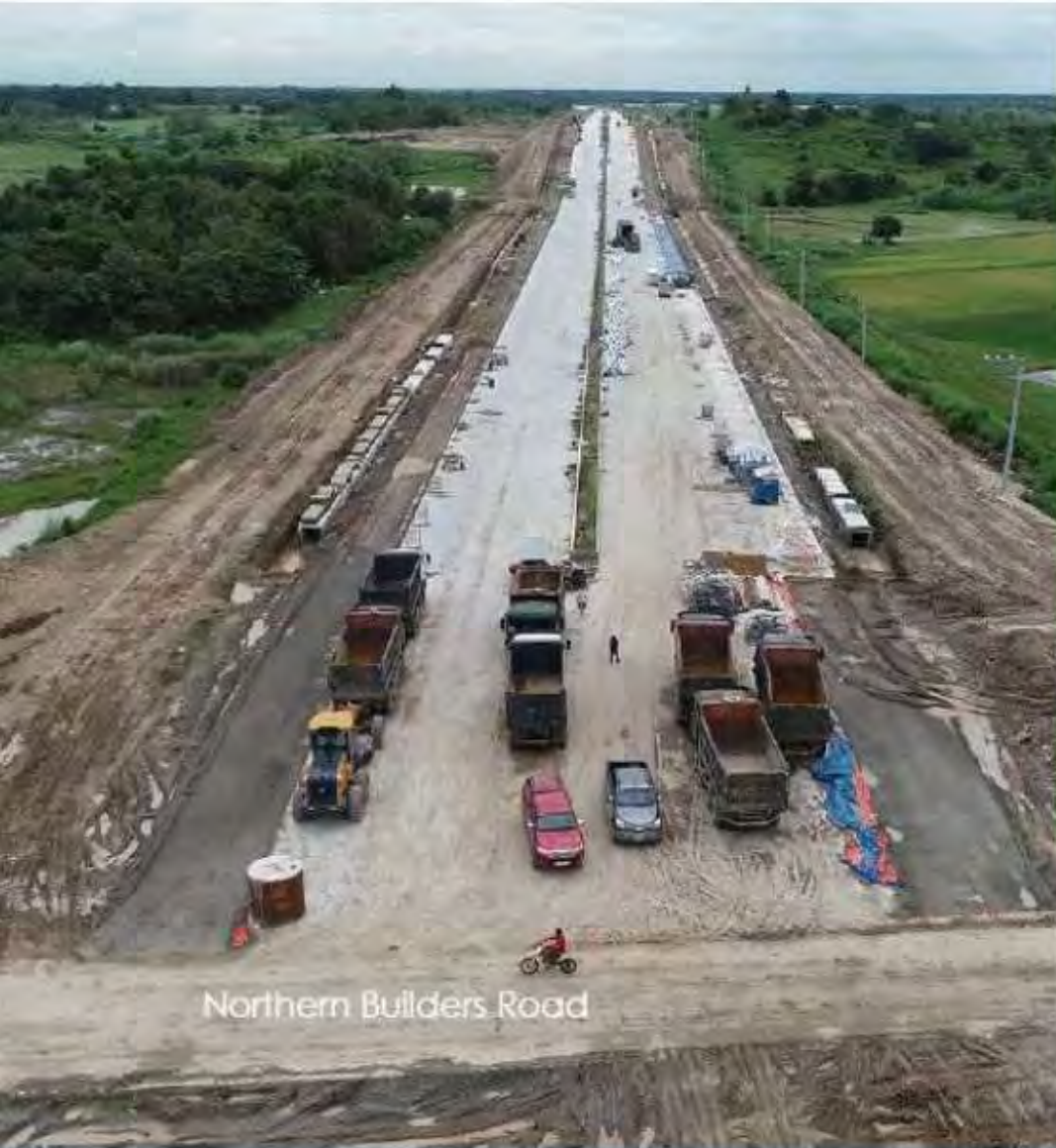
Northern Builders Road