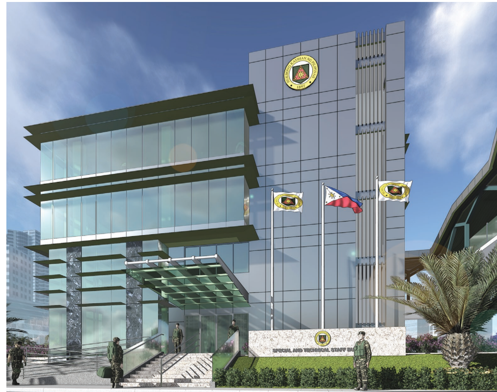
« Artist's render of the Special and Technical Staff (STS) building of the Philippine Army at Bonifacio South Pointe.