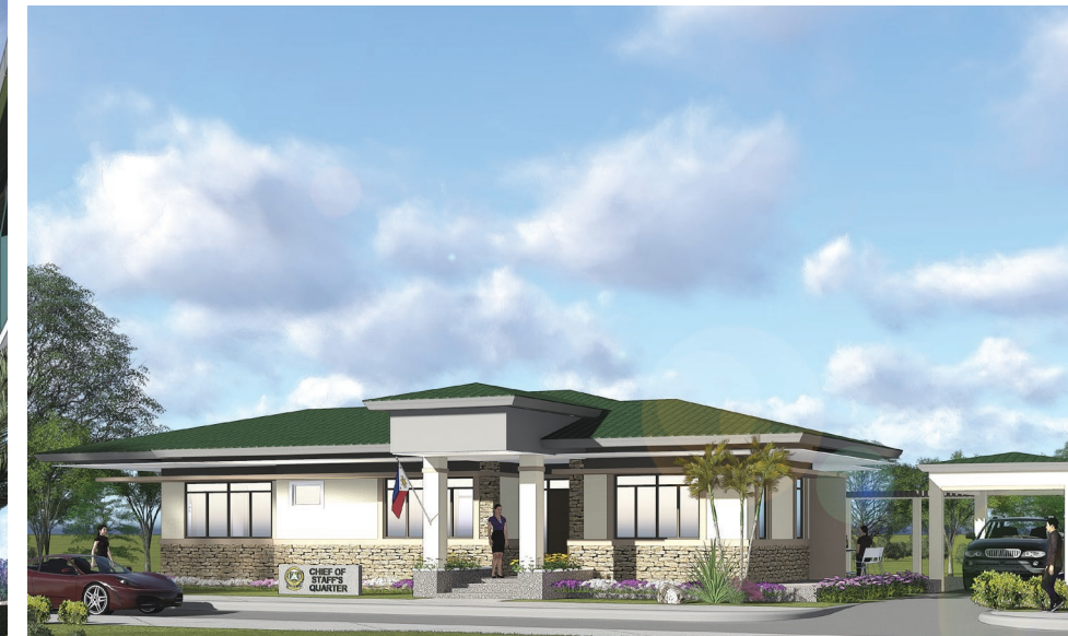
« Artist's render of the Chief of Staff's quarters at the ASCOM compound in Camp Servillano Aquino, Tarlac.