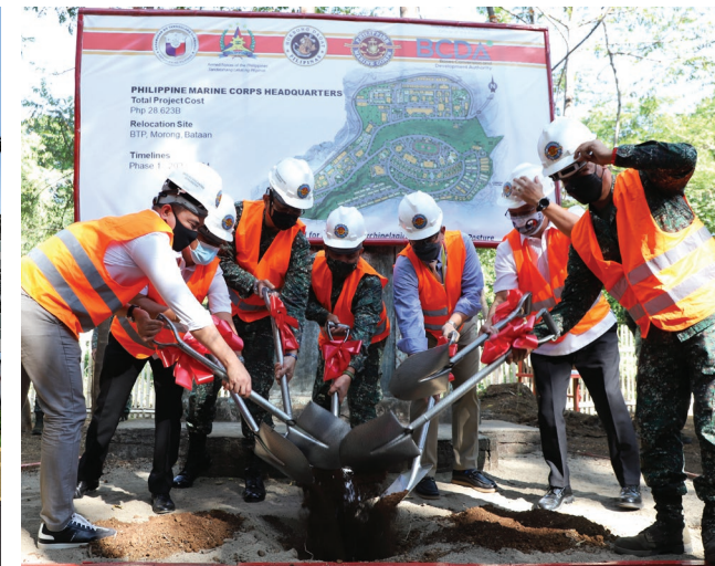
DND, BCDA, and Subic Bay Metropolitan Authority officials at the groundbreaking of the Philippine Marine Corps Headquarters at Bataan Technology Park in Morong.