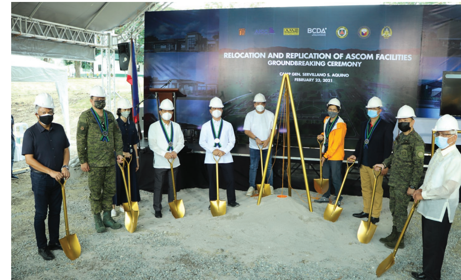
« BCDA and DND officials lead the groundbreaking ceremony of the ASCOM Facilities held February 23, 2021.