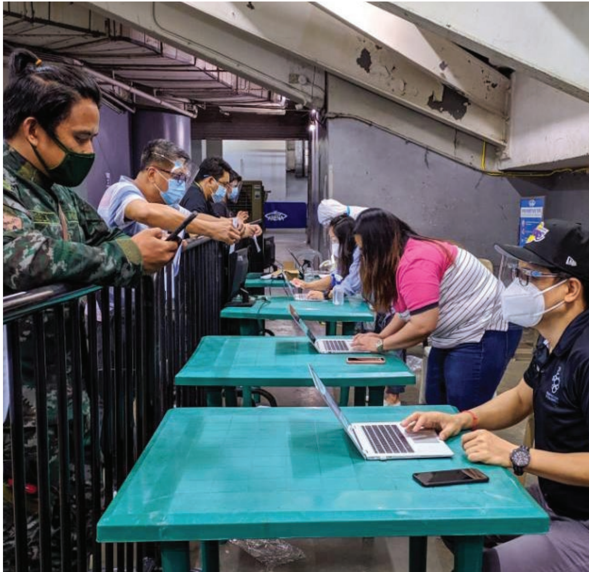
BCDA volunteers were mobilized to help manage the SM Mall of Asia Arena swabbing facility, one of the four Mega Swabbing Facilities that were established during the COVID-19 surge.