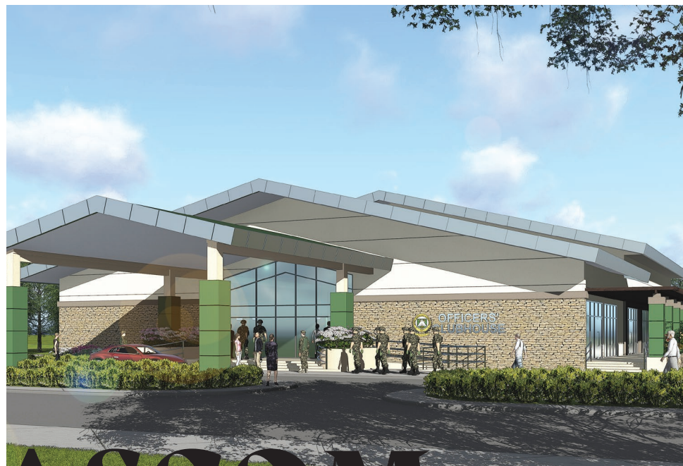
« Artist's render of the Officers' Clubhouse of ASCOM at Camp Servillano Aquino in Tarlac.