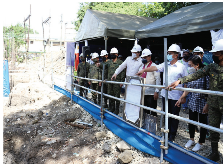
» BCDA and DND officials inspect the site of the five-storey STS building of the SSC and DACC during its groundbreaking ceremony held December 16, 2021.