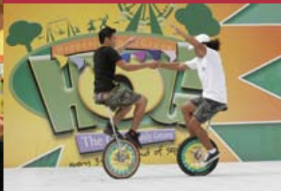
The Clark ecozone has been a popular venue for crowd-drawing events attracting tourists here and abroad.