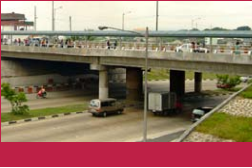
The Sampaguita Bridge

of the transformer pad as requested by the City Government of Taguig. Project cost is Php2.1 million. Actual accomplishment as of December 31 was 98.45 percent.