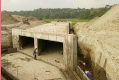
Shown is a reinforced concrete box culvert in Brgy. Dampe, Floridablanca, Pampanga (above) and the installation of rebars of the Pasig-Potrero Bridge at Angeles, Pampanga (below).