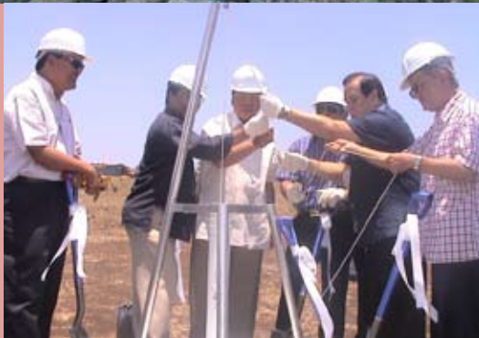
Senator Richard Gordon (second from right) leads the capsule-laying ceremonies for the new road network in the zone.