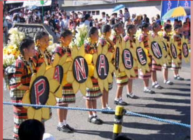
Special projects for the year were the Camp John Hay Annual Art Contest held in October (top) and JHMC's participation in the Baguio Flower Festival in February (bottom).