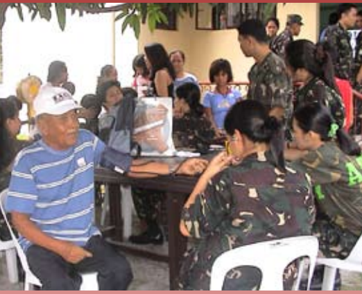
Tarlac medical mission in cooperation with the First Talon General Hospital

The Bases Conversion and Development Authority (BCDA) remains cognizant of its role in uplifting the lives of the Filipinos through the various social development programs and projects that it has initiated through the years.