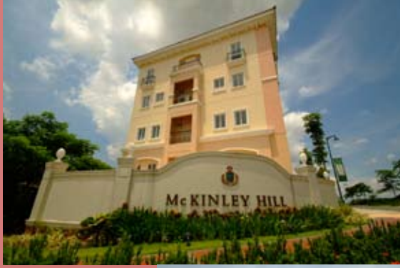
McKinley Hill (top & right) Pacific Plaza Towers (bottom)