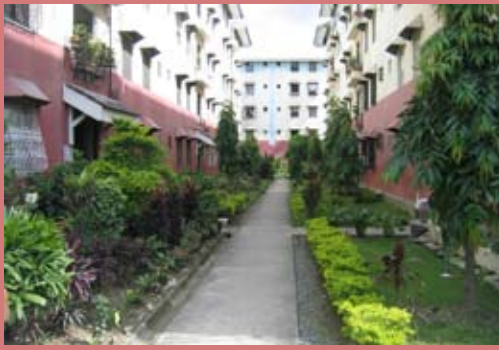
Pamayanang Diego Silang