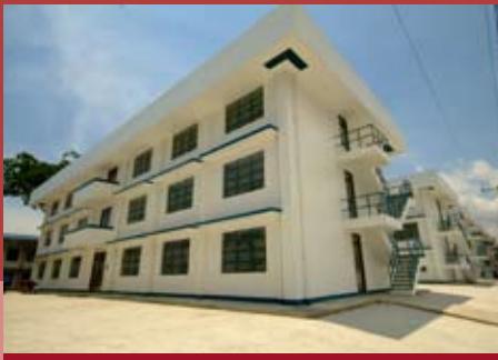
One of the replicated dorm facilities of the Philippine Air Force (top).