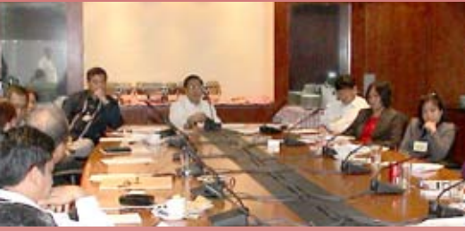
BCDA officers undertake a visioning and mission reassessment workshop