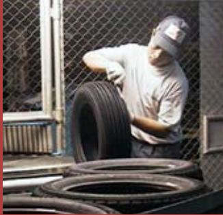
Yokohama, Cyber City Teleservices and Hansa Toys Manufacturing have expanded their businesses in the Clark Special Economic Zone.