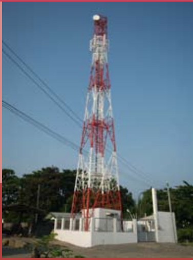
Modernization of the San Fernando Airport is ongoing to comply with standards of the Air Transportation Office (above & right).