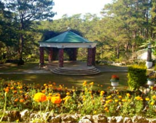
The Bell House and Amphitheater—favorite tourist spots in the Camp (left & bottom)