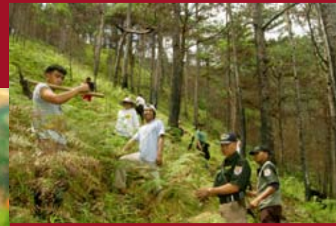
Environment laws are strictly being observed in Camp John Hay.