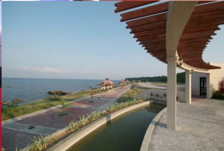
The Coral Promenade