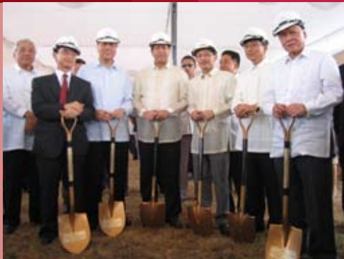
Groundbreaking ceremonies for the SCTEx