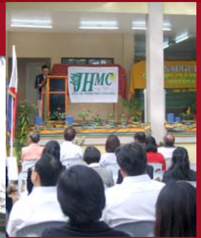
Inauguration of the Customs Clearance Area and Warehouse inside Camp John Hay (above)