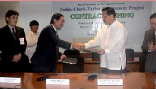
Contract signing for the construction of the Subic-Clark-Tarlac Expressway

The role that the Bases Conversion and Development Authority (BCDA) plays in the development of Central Luzon can not be overemphasized. Several programs and projects have been launched to boost the region's economy and uplift the lives of the people. Equally important, partnerships between the national line agencies, local government units, private sector and civil society have been strengthened to ensure that BCDA is one with the people of Central Luzon in fasttracking developments in the region.