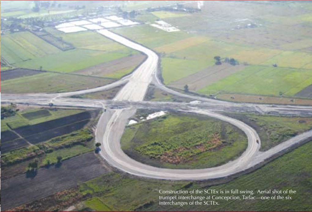
Construction of the SCTEx is in full swing. Aerial shot of the trumpet interchange at Concepcion, Tarlac—one of the six interchanges of the SCTEx.

The timely completion of BCDA's expressway together with the Subic seaport, Clark's upgrading of the Diosdado Macapagal International Airport and the NorthRail will not only integrate the economies of the seven provinces of Central Luzon, but will also integrate the economy of Central Luzon to the rest of the world.