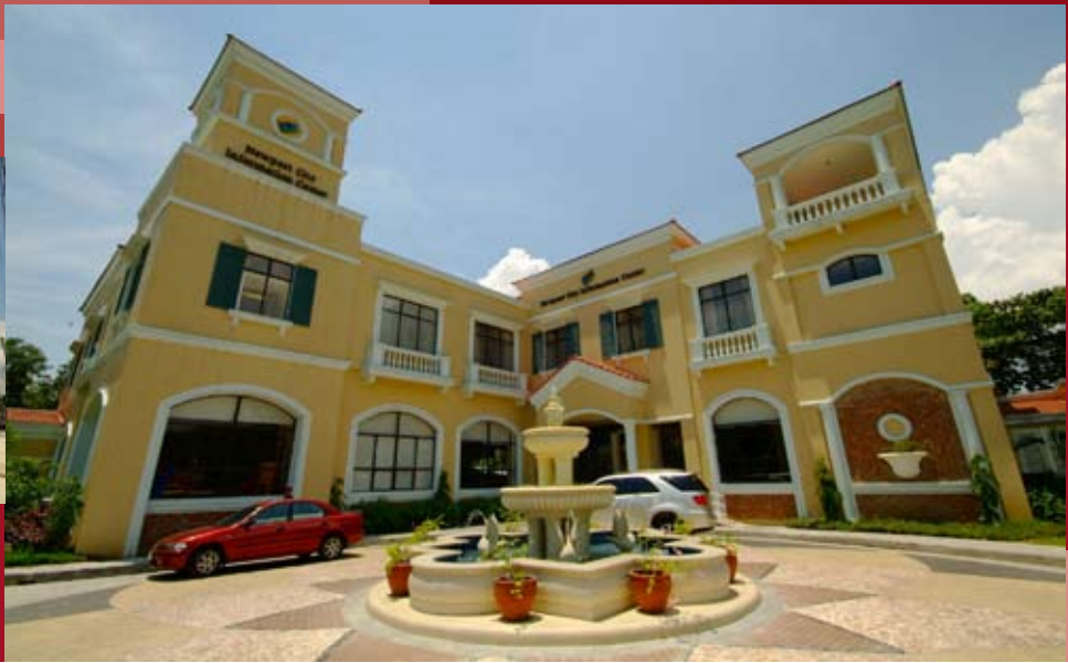
Shown is the Information Center of the Newport City, a Megaworld project at the Villamor Air Base (right)

replanned. More importantly, issues in the cost-sharing, development and construction of Bonifacio Avenue, the main thoroughfare envisioned to yield value to the properties, were resolved with Metrobank, the other major property owner in the area. The construction of Bonifacio Avenue and the laying down of the utilities in North Bonifacio were expected to prime the area for more revenue-generation for BCDA.