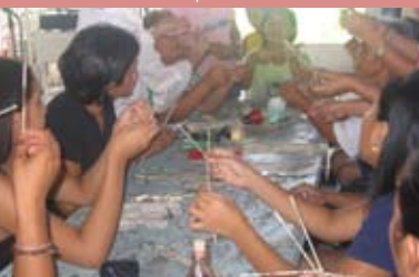
Livelihood seminar at Pamayanang Diego Silang

Formerly the Fort Bonifacio Summit Housing Project, the NSHP—a 1.3-hectare property located along the MacArthur Road—was declared by the BCDA Board as a relocation site. To date, BCDA is waiting for the Taguig Sangguniang Bayan's approval of the proposed survey plan for the NSHP.