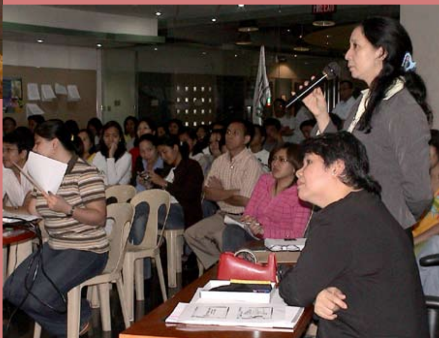
BCDA General Assembly

The redefinition of BCDA's Vision and Mission statements was among the highlights of the year and this move was in harmony with the launching of BCDA's greatest undertaking—the Subic-Clark-Tarlac Expressway (SCTEx).