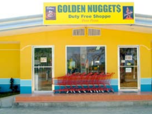
The Golden Nuggets Duty Free Shoppe is among the top revenue-generating locators in Poro Point.

For instance, PPMC recently installed a modern state-of-the-art weather facility worth Php2.7 million at the airport to enhance its operational safety by informing pilots of important data needed to make a safe landing and take off. The PPMC also entered into an agreement with Ultra Seer, Inc. for the procurement of crash, fire and rescue (CFR) protective clothing and equipment for the Crash and Fire Rescue personnel of the airport.